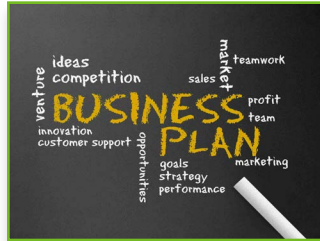
Leanstack Canvas – Business Plan on a Page

Every day our volunteers help small businesses and nonprofits find success – to be resilient, open businesses and add jobs that support our local economy. Our workshop program continues to offer new training topics in our virtual platform to reach our communities most efficiently.