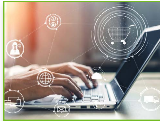
Launching your eCommerce Store the Right Way