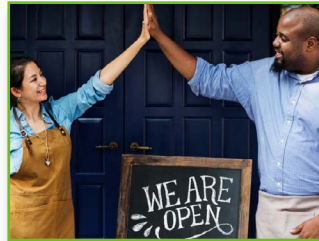
How to Start and Operate a Small Business