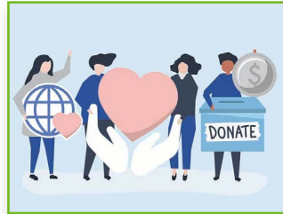
What it Takes to Start and Run a Successful Non-profit