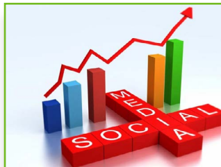
How to Create “Killer Content” for Social Media and Your Website