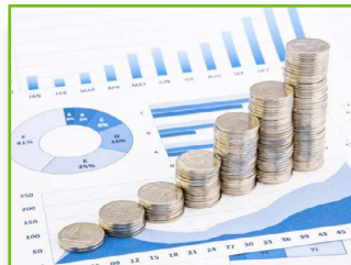
Have Your Best Sales Year Ever: How to Avoid Unpaid Consulting