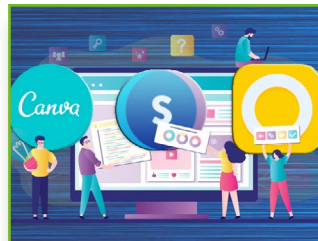
How to Create Snazzy Graphics for LinkedIn & Social Media